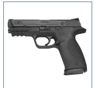
Answering the changing needs of law enforcement and military Smith & Wesson has developed a M&P or Military & Police line of firearms and engraves these guns on DATRON M8 high-speed machining centers.