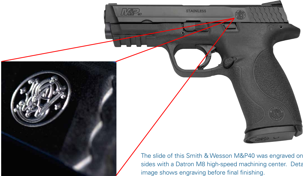
The slide of this Smith & Wesson M&P40 was engraved on 3 sides with a Datron M8 high-speed machining center. Detail image shows engraving before final finishing.

A single Datron M8 high-speed machining center keeps up with the supply of slides produced by 9 Tsugami machines in Smith & Wesson's M&P handgun production cell.