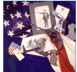
The Model 10 is the only handgun in the world that’s been in production since it was introduced in 1899.